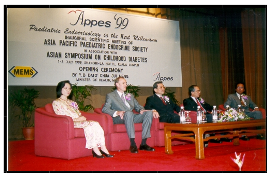
Official Welcoming Party